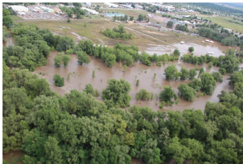
Open space preserved in McMurry Natural Area and Legacy Park along the Poudre River in Fort Collins. Floodwaters in the September 2013 event were able to spread out and slow down and not cause damage.